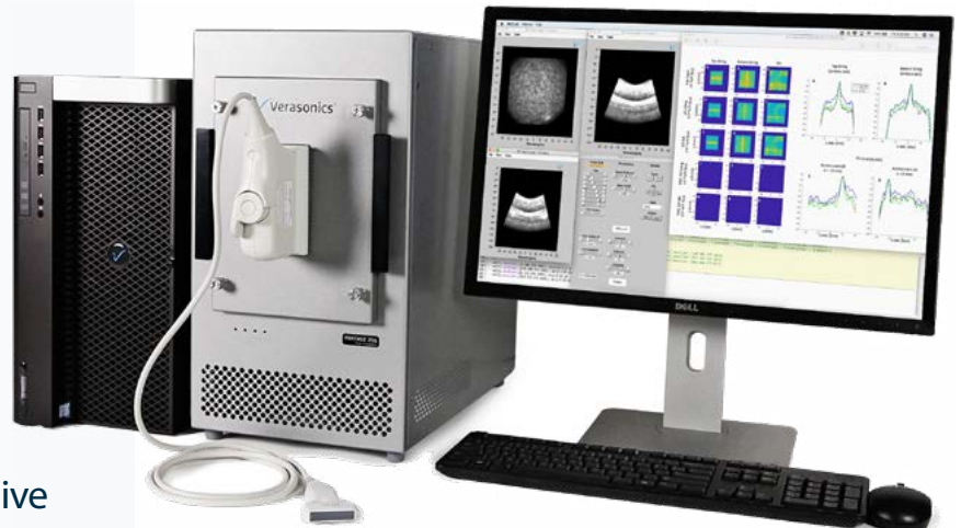
Verasonics Vantage ™ Research Ultrasound System

We are committed to providing superior product solutions along with comprehensive support services.